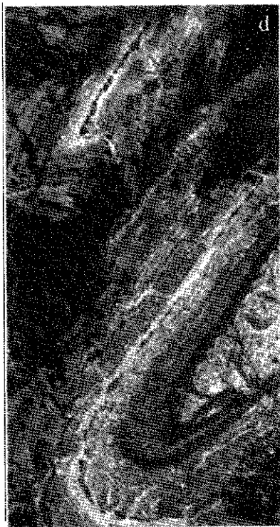
Figure 1. The western Haymond Mountains: a synform in the Tesnus Formation, Dimple Limestone, and Haymond Formation. Each image represents an approximately 5 by 10 km area. North is toward the top of the page.

a. Image created by composing the visible TM bands into an RGB image, then converting it to grayscale. This picture would be similar to low resolution aerial photographs of the area.