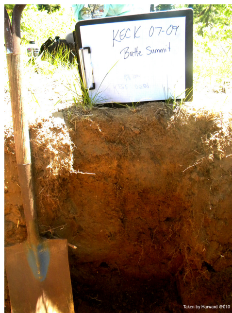
Figure 5: Typical soil pit for the study region.

Surface and groundwaters within the Deschutes watershed were sampled to capture the diversity in lithology, climate and landuse. Students chose