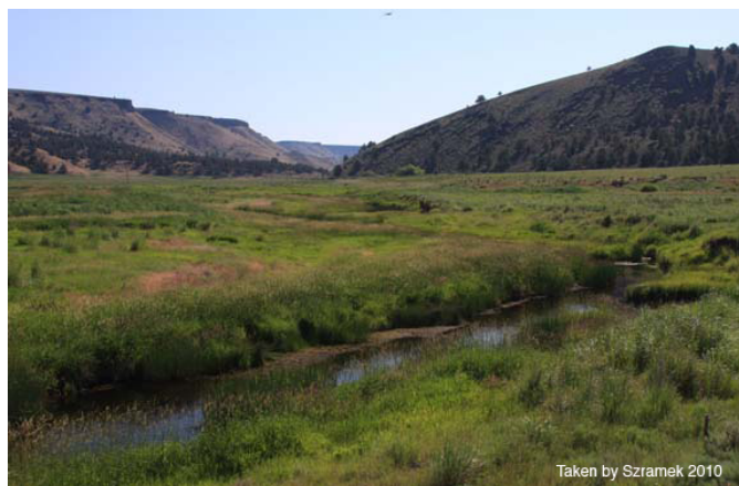
Figure 4: South Fork of the Crooked River. Notice the sparse vegetation on the slopes away from the riparian zone.

Columbia River and drains approximately 27,195 km 2 with an average discharge of 5816 cfs (United State Geological Survey, 2010). The project focuses on the Upper Deschutes watershed, which mainly drains the eastern High Cascades to the west (Figure 3) and the Crooked River watershed (Figure 4), which drains area to the east and the Ochoco Mountains. Land use within the watershed is mainly federal managed forests (Deschutes and Ochoco NF) and federally managed Grasslands (e.g. Crooked River National Grassland) watershed, along with extensive irrigated crop and rangeland in the east portion of basin. Pine forests dominate the upland regions while sagebrush, grasses, and juniper are the dominant vegetation in the low land regions. The main population centers in the region include the areas surrounding Bend, Redmond, and Prineville, however the region has a relatively low population density of fewer than 25 persons per square mile.