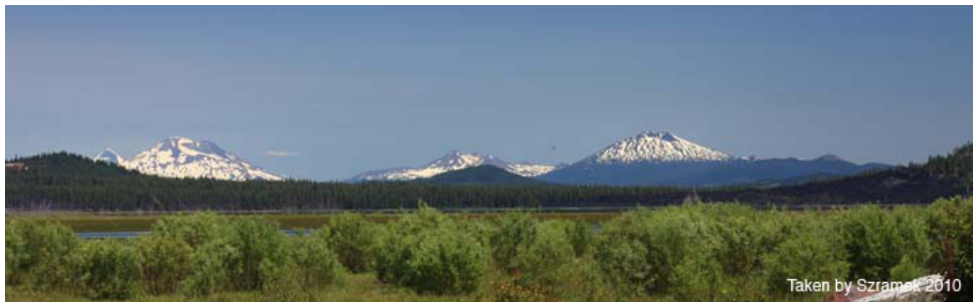
Figure 3: View from Davis Lake looking north with Mt. Bachelor and the Three Sisters to the north and the crest of the Cascades to the west.

rials, the nature of tephra deposits and the colder soil temperatures the soils tend to have weak horizon development. In the La Pine Basin (the upper section of the Deschutes watershed south of Bend, Oregon) soils are formed mainly of pumice and ash deposits from the eruption of Mt. Mazama and tend to only have weakly developed A horizons and often limited B horizon development (Myhrum, R. and Ferry, W., 1999).