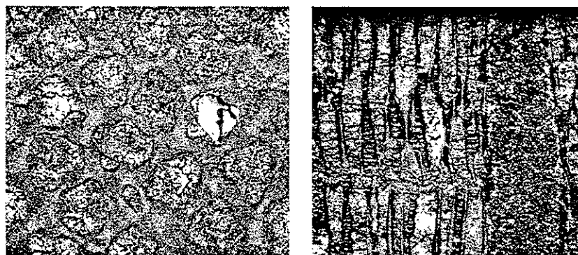
Figure 4 – Acetate peels of Stigmatella crenulata : tangential cut, left 50X; lateral cut, right 18X.

In addition to the rare edrioasteroids, a large encrusting bryozoan covers about 20% of the hardground. By making a tangential cut and associated acetate peel of one of the bryozoan mounds, it was identified as Stigmatella crenulata (Fig. 4). The size of the bryozoan colony suggests that the hardground was exposed on the sea floor for an extended period of time.