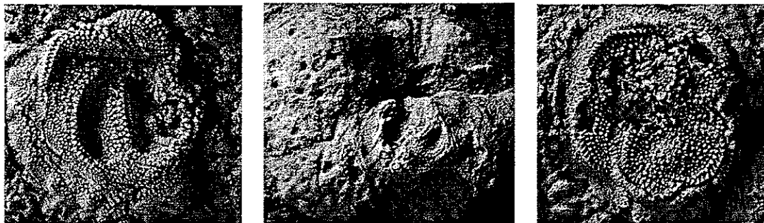
Figure 3 – Carneyella ulrichi , 21.3mm in diameter, left; Carneyella pilea attached to a bryozoan, 13.9mm in diameter, center; Carneyella ulrichi , 18.1mm in diameter, right.

The diameters of all the Carneyella ulrichi are similar, ranging from 16.7 mm to 23.5 mm. This suggests that they are all from the same generation. This is also seen in Meyer's (1990) study of two Upper Ordovician edrioasteroid beds. No juveniles are present on this hardground.