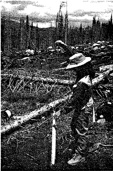
Figure 1. Sampling groundwater in the Pearl Creek watershed.

A gage station was established in each watershed to monitor stream discharge. Staff gauges were installed and stage-discharge relationships were determined from velocity and cross-sectional area measurements. In four of the catchments data loggers equipped with pressure transducers were installed and stage was continuously recorded. The data loggers were also equipped with thermocouples to measure air and stream temperature and one was attached to a tipping bucket rain gauge.